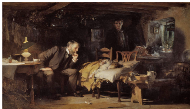
Figure 1. The Doctor . Luke Fildes, The Doctor . 1891, oil on canvas, 65 in × 95 in (166 cm × 242 cm), Tate Gallery, London. This work of art was meant "to put on record the status of the doctor of our time" ( The Times , March 17, 1891).

In the last decade of the 1800s, Luke Fildes, a noted artist of the time, was commissioned to create a painting (Figure 1). As for many artists at that time, the subject matter was left to his discretion, and so Fildes decided to paint something that was very meaningful to him. In 1877, his one-year-old boy had died. He had never forgotten the tragic event, but also the care of the physician that came to his home regularly to see the little boy. The focal point of the artwork is the physician, kneeling, gazing with a grave expression upon the child. The father is looking on from behind the chairs while the mother cradles her head in her arms, inconsolable. The painting, entitled The Doctor , "put on record the status of the doctor of the time" ( The Times , March 17, 1891). Fildes' painting showed a professional and compassionate physician to the world; it was widely reproduced and became a best seller. Many medical schools and doctor offices still display reproductions of the painting as the symbol of professional devotion of the physician. Yet, in 1877, there was very little that this physician could tangibly